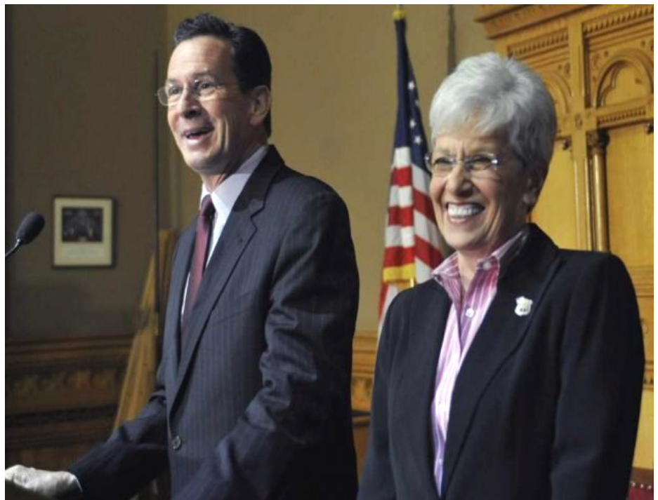
Nancy Wyman and Dan Malloy have had their work cut out for them with the current economic crisis.

I don't want people like you or my grandkids for example to pay the price of the mistakes that were made in the past. My family and I never came from any kind of background involving politics. The Governor and I are trying to do what we think is best for the State in the long run.