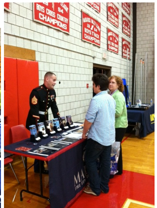
Students were able to gather information on colleges, the military and trade schools.